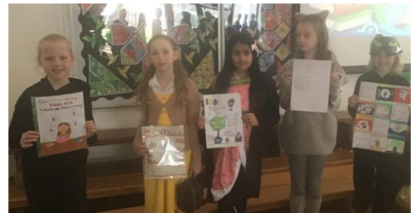
Book Fair Poster winners - well done!

Thank you to everyone who helped make this such a successful and enjoyable week. It truly has been an amazing celebration of reading for our whole school community.