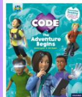
The Adventure Begins