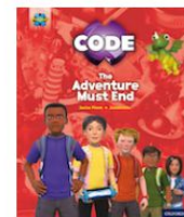
The Adventure Must End